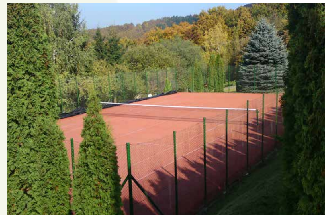
Sweden, Lidingö, 1 court

We reserve the right to amend these specifications